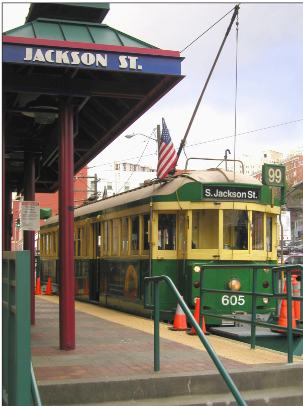
Jackson Street Trolley

The previously implemented wireless mesh surveillance system connected nine cameras over a six square block area to maintain safety. This system was inefficient and unreliable causing information loss, and was difficult to support. Cascade Networks decided to find a better solution that would be easier to maintain and expand going forward, serving this booming multicultural community.